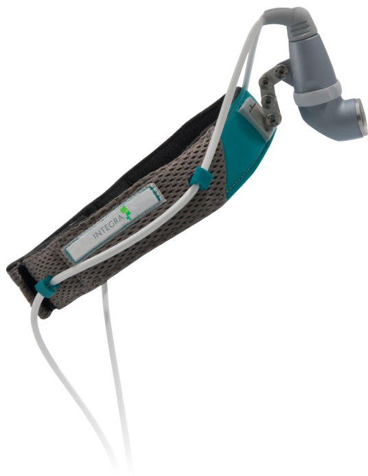
UltraLite™ Plus Sweatband