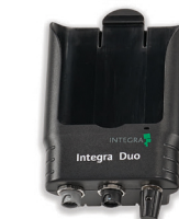
90621 battery holster