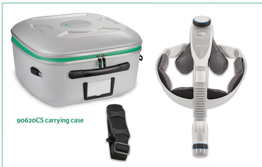
90620CS carrying case