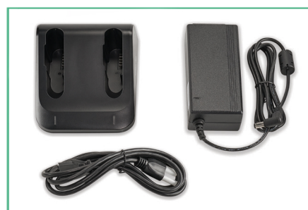
CHARGER WITH POWER SUPPLY & CORD