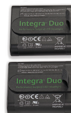
90622 batteries (x2)