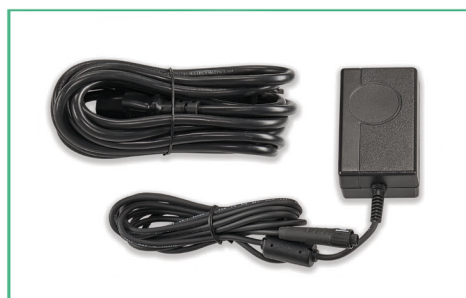
90690 direct power AC cable only for wall plug